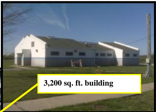
3,200 sq. ft. building